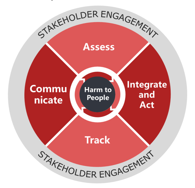
Figure 4: Vendor Due Diligence Process

In response to the COVID-19 pandemic and the possibility of future crises, vendors are recommended to conduct their due diligence checks virtually when necessary.